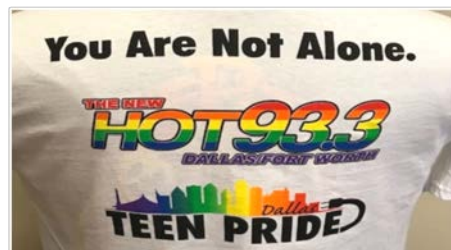
2017 & 2018 Platinum Sponsor