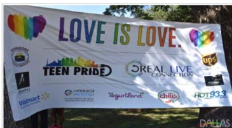
2017 Platinum Sponsors