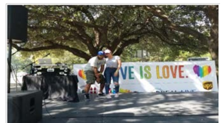
2017 & 2018 Platinum Sponsor